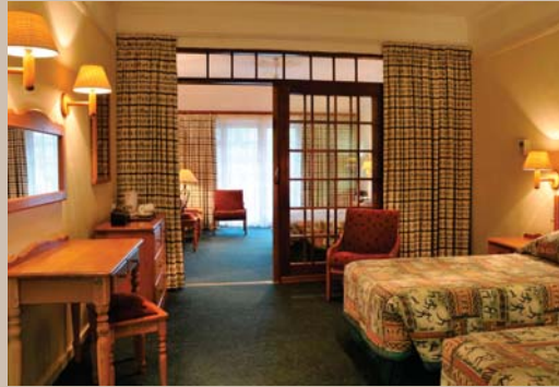
STANDARD INTER-LEADING ROOM